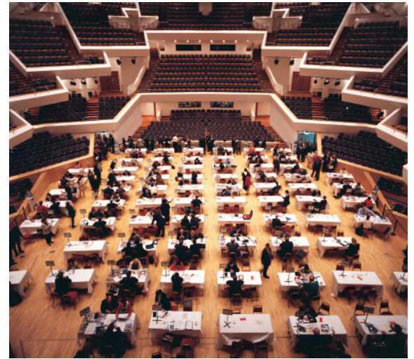
Conference venue, Waterfront hall, Belfast